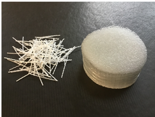
Macro synthetic fibres MasterFiber 246 SPA

In compliance with the European Regulation (EU No 305/2011 and EU No. 574/2014) the product is provided with the CE marking according to UNI EN 14889-2 and the relative DoP (Declaration of Performance).