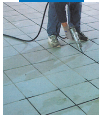
Sealing ceramic tile floor with Mapesil AC