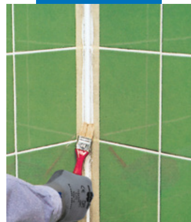
Smoothing the joint with soapy water and a small brush