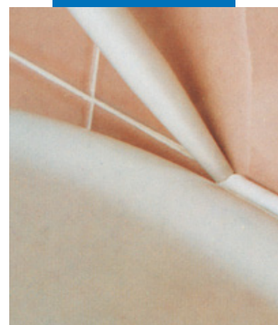
Sealing sanitary ware