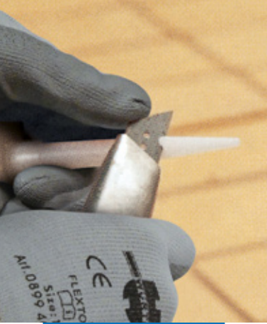
Cutting the nozzle according to the size of the joints