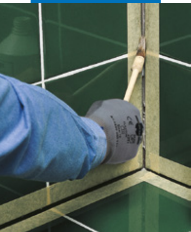
Application of Primer FD