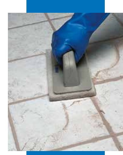
Finishing with a Scotch-Brite® pad