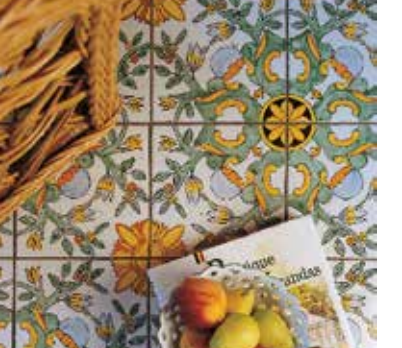
An example of a grouted double-fired tile floor

All relevant references for the product are available upon request and from www.mapei.com