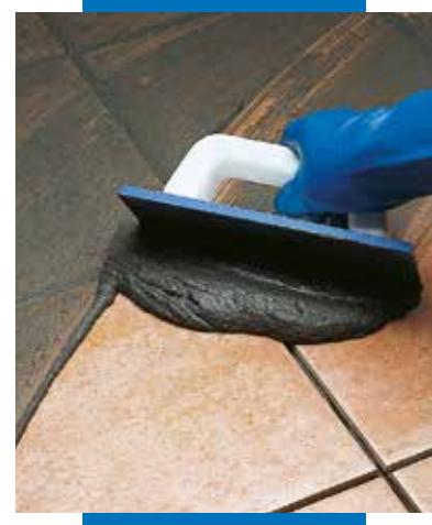
Grouting single-fired tiles with a float