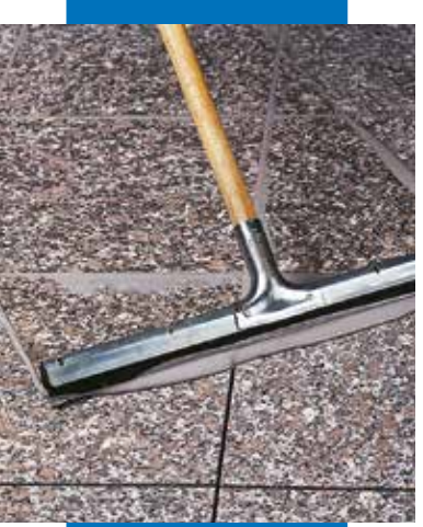
Grouting of pre-smoothened and glossed granite floor with rubber float

be caused by residual moisture contained in adhesives, not fully hydrated grouts, in substrates not adequately dried, or in substrates not adequately protected from rising damp.