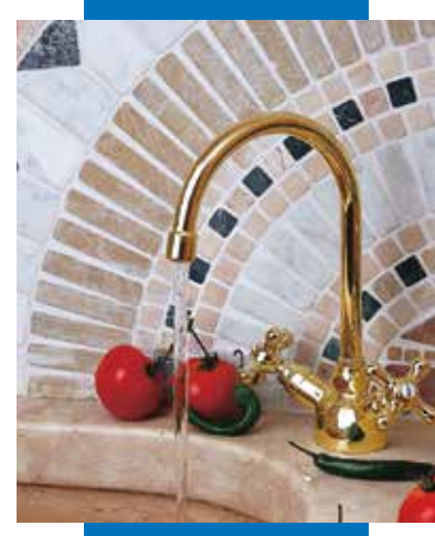
An example of a grouted mosaic tile kitchen