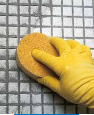
Finishing a glass mosaic with a sponge