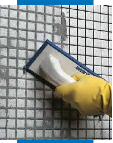
Grouting a glass mosaic (bathroom) with a float